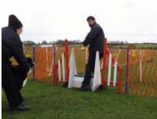
First Step – The Handler encourages his dog over 1 jump. The dog is restrained by the trainer. The handler throws ball & RUNS.