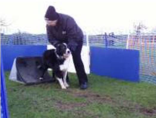
Now held on the box. When the dog is confident over the 4 jumps, he can go to the next stage.