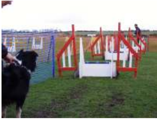
Fourth step 4 jumps