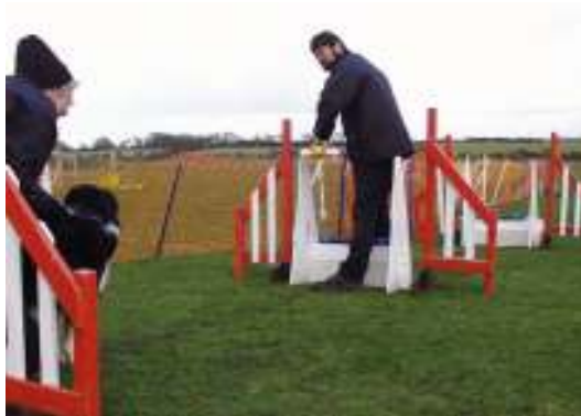
Second step – 2 jumps. The handler RUNS & must play with dog at the back.