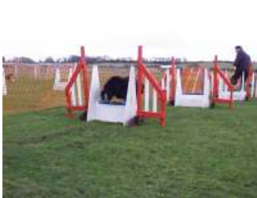
Third Step 3 jumps