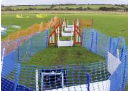
Layout for basic training.