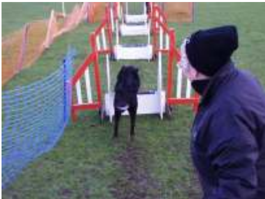
Progressively moving further back