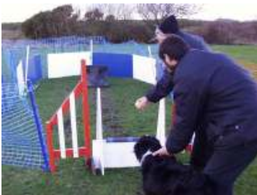
Now for first time dog is held facing the box. The ball is thrown into the netted area in front of the box.